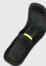
515803 Nylon Belt Pouch, NitexPro / 2AA