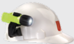
514819 - Universal Helmet Clip For slotted or brim style helmets (visit uwk.com for more info)