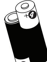
4 Alkaline AA-cell batteries