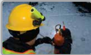
Mounts to any hard hat with UK helmet clips