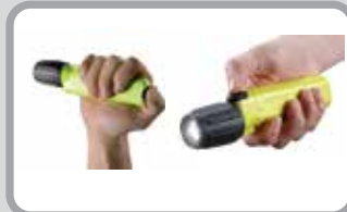
Available in front and rear switch configurations