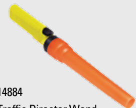
14884 Traffic Director Wand 3AA eLED CPO/4AA eLED Zoom