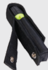
14816 Nylon Belt Pouch, 4AA/3AA